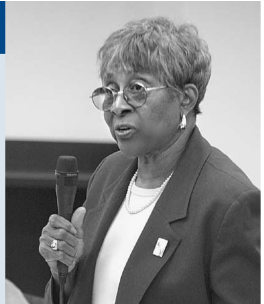
SPS #09-7099 lam

Lakeview Elementary School Multi-Purpose Room 10501 – 47th Ave. SW Lakewood, WA 6:00 pm – 8:00 pm